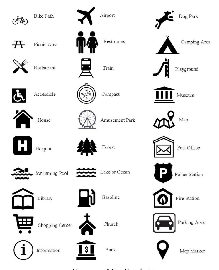
Common Map Symbols

Requirement 4 - Recite the Outdoor Code and Leave No Trace Principles for Kids. These may be found on page 318 of the Wolf